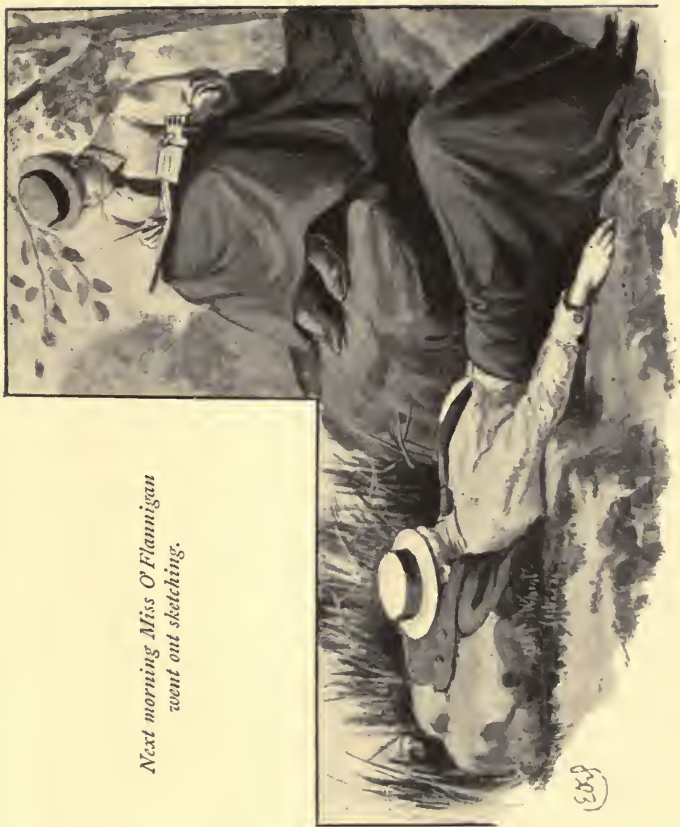
Next morning Miss O'Flannigan went out sketching.